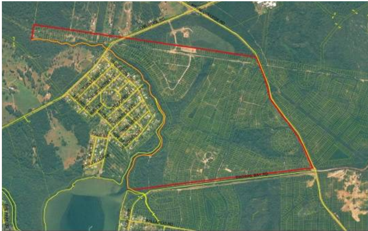
Figure 2 - Aerial photograph and cadastre