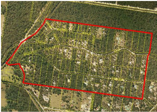
Figure 2 Aerial photograph of the subject land

As originally registered, the Estate consisted of 166 lots, with land areas varying in size from 1200 m 2 to 1.75 hectares. Of the 166 lots, 102 have an area less than 4000 m 2 .